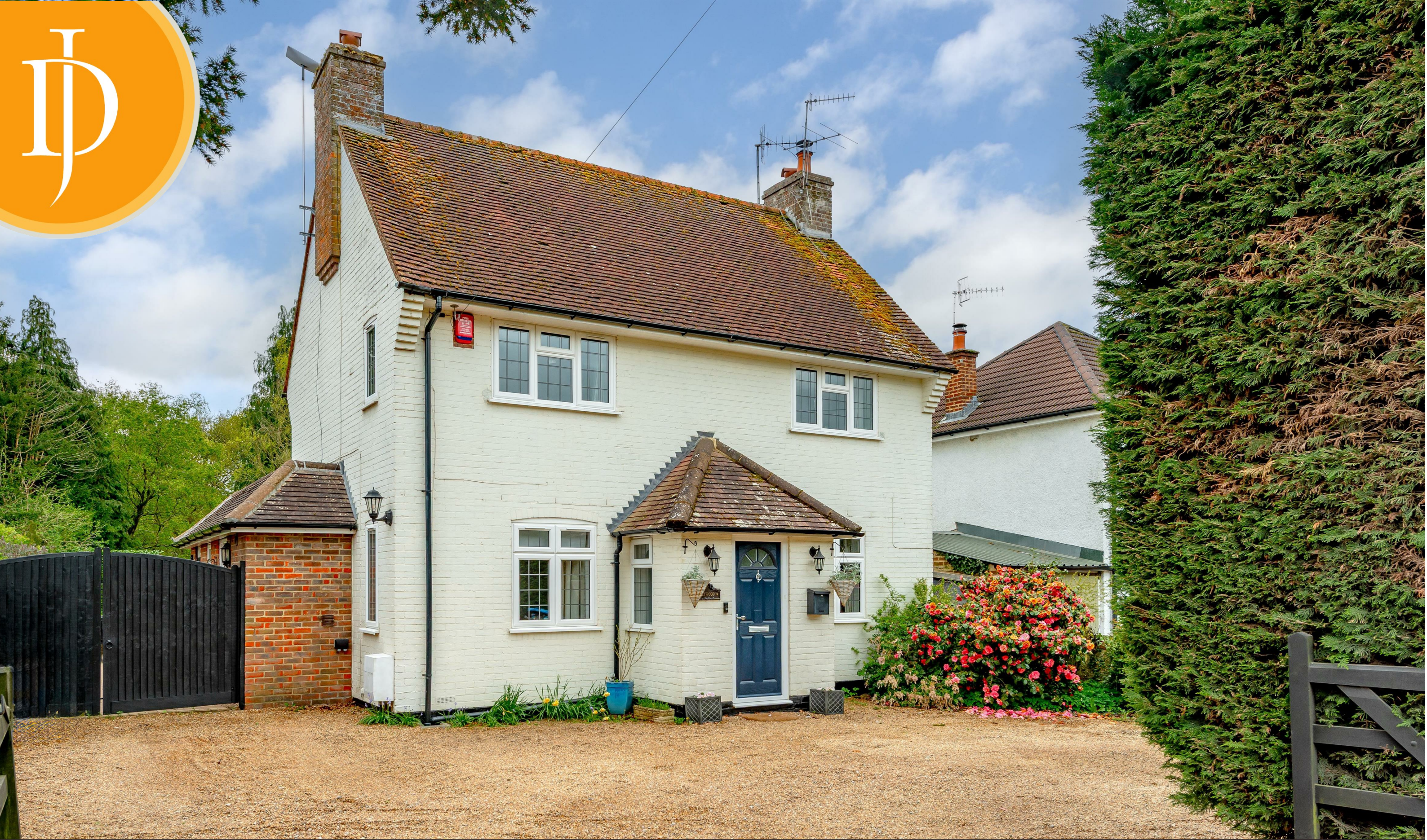
Leywood, Effingham Road, Burstow, RH6 9RP Asking Price £700,000